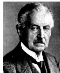
Carl Runge (1856–1927)

The goal of this exercise is to demonstrate understanding of Runge's theorem: If K is a compact subset of \mathbb{C} , then every function holomorphic in a neighborhood of K can be approximated uniformly on K by rational functions. Moreover, if E is a set containing at least one point from each bounded component of \mathbb{C} \setminus K , then the poles may be taken to lie in E .