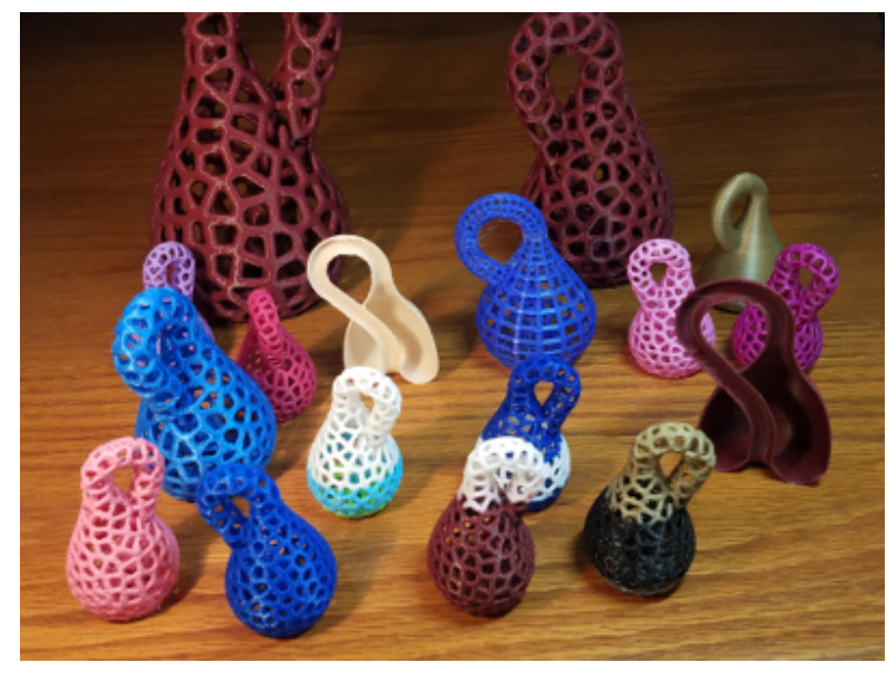
Some Klein Bottles